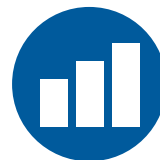
Cooperative Performance & Research